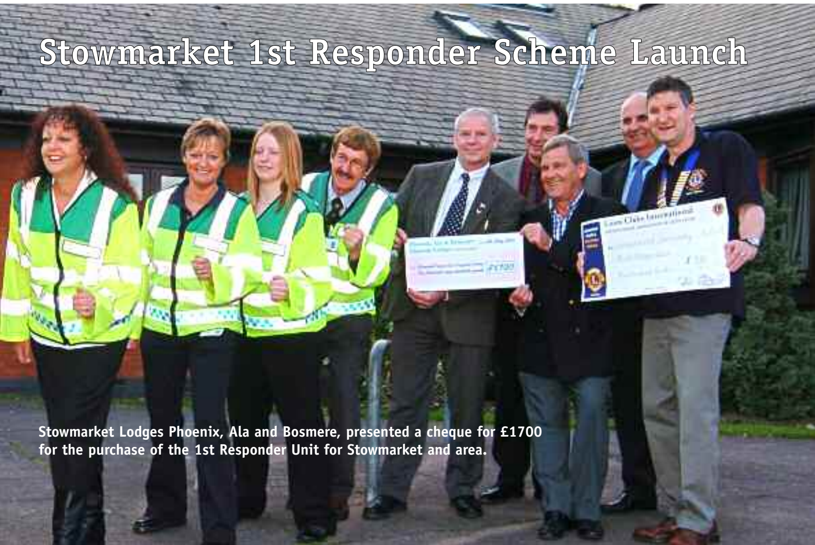
Stowmarket Lodges Phoenix, Ala and Bosmere, presented a cheque for £1700 for the purchase of the 1st Responder Unit for Stowmarket and area.