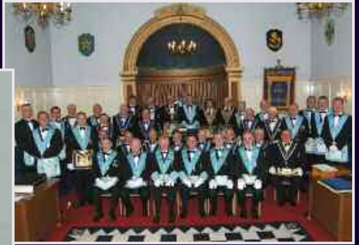
Corinthian Lodge No 3093 celebrated its 100th Anniversary earlier in the year. Pictured is the PGM presenting the Centenary Warrant to the WM assisted by the Provincial Grand Secretary.